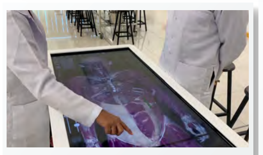
Electronic Dissection Table